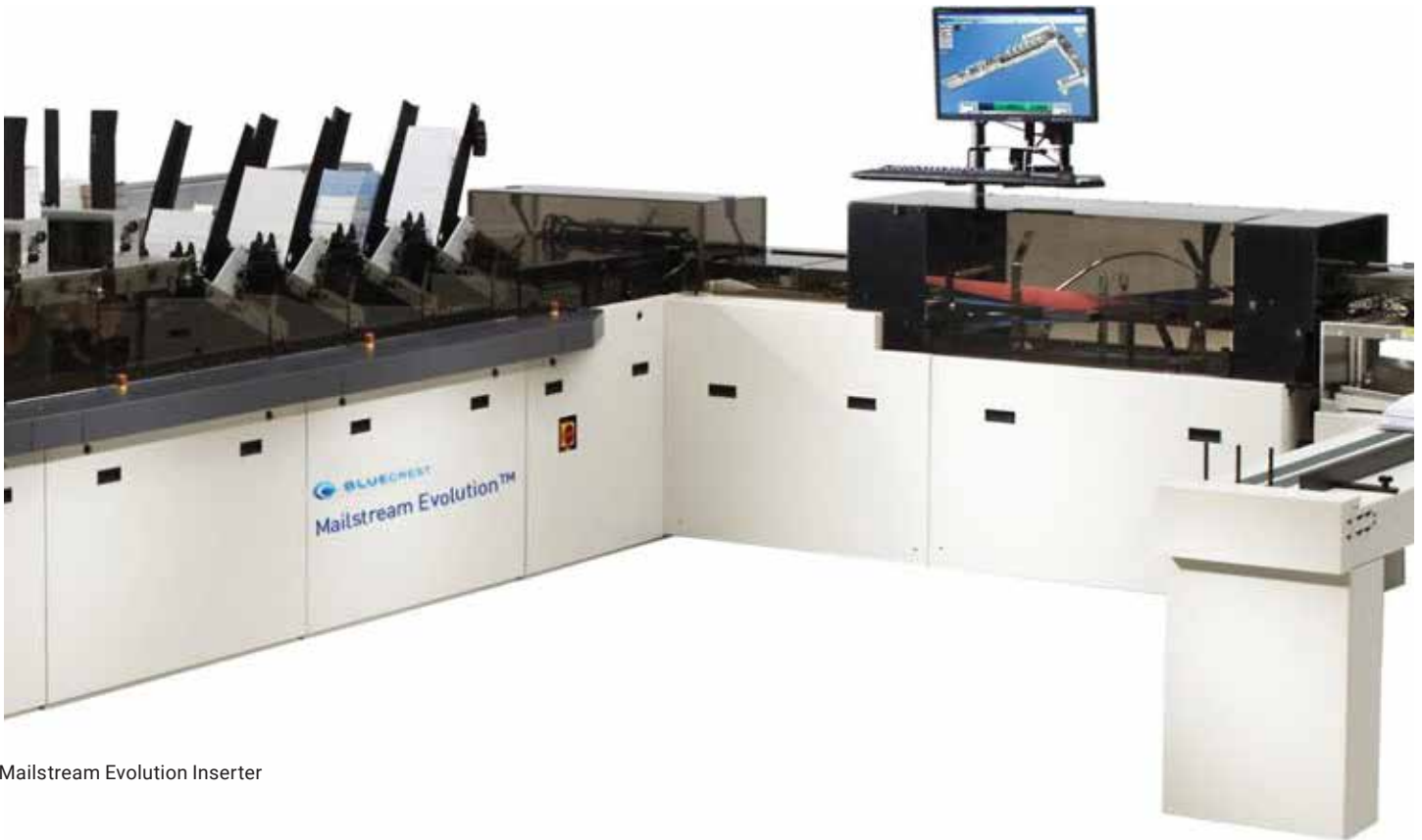
Mailstream Evolution Inserter