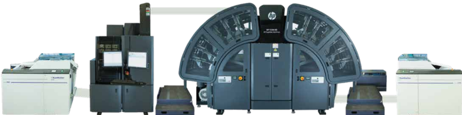
IntelliJet® 20 HD Printing System