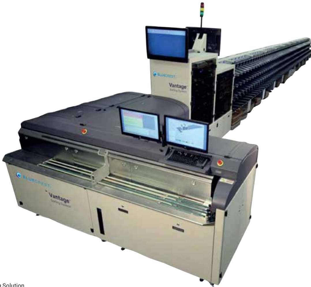
Vantage™ Sorting Solution